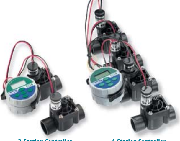
2-Station Controller 4-Station Controller