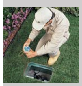
Open the valve box and set the program information on your Smart Valve Controller.

Are you faced with adding some additional zones to alleviate the problem of having too many sprinklers on a zone? Perhaps you're dealing with the continuous repair of broken wires from the controller to the valves? If the prospect of additional valve wire runs or adding another standard electrical controller is not an option, the Smart Valve Controller can provide the ideal solution. Simply install one of Hunter's battery-operated controllers at each additional zone required and quickly, economically, you'll make the entire irrigation system more efficient.