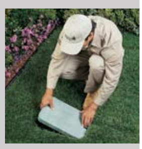
Replace the valve box cover and the hermetically-sealed controller is protected from water, dirt and contaminants.