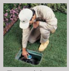
Then attach the controller to the valve (or, if it's a complete kit, install the combination controller/valve).