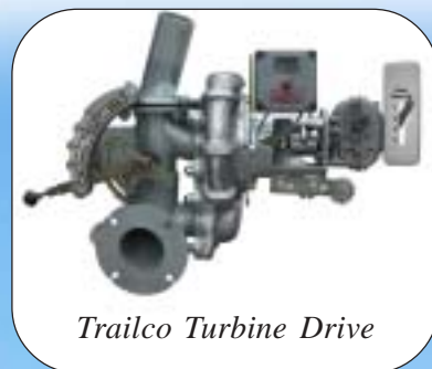
Trailco Turbine Drive

Other Sizes available to match your specifications