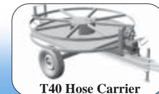
T40 Hose Carrier