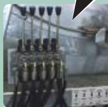
Full Hydraulic controls