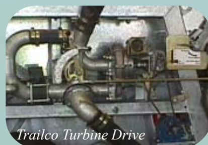
Trailco Turbine Drive