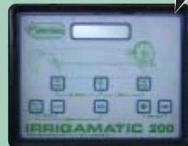
Optional Computer Control